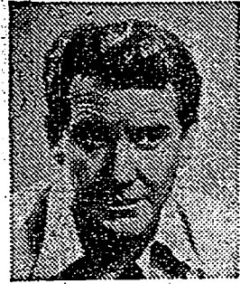
and your host Burgess Meredith