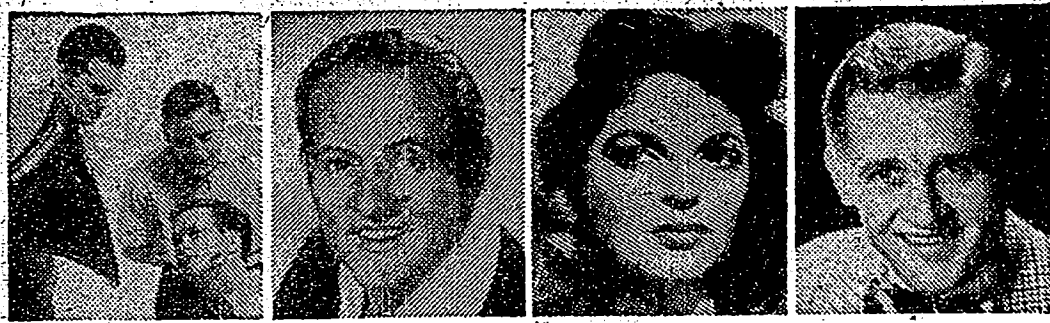
Kingston Trio from UCLA Campus, Art Linkletter from Indiana State Fair, Julie London from Las Vegas, Alan Young from San Diego